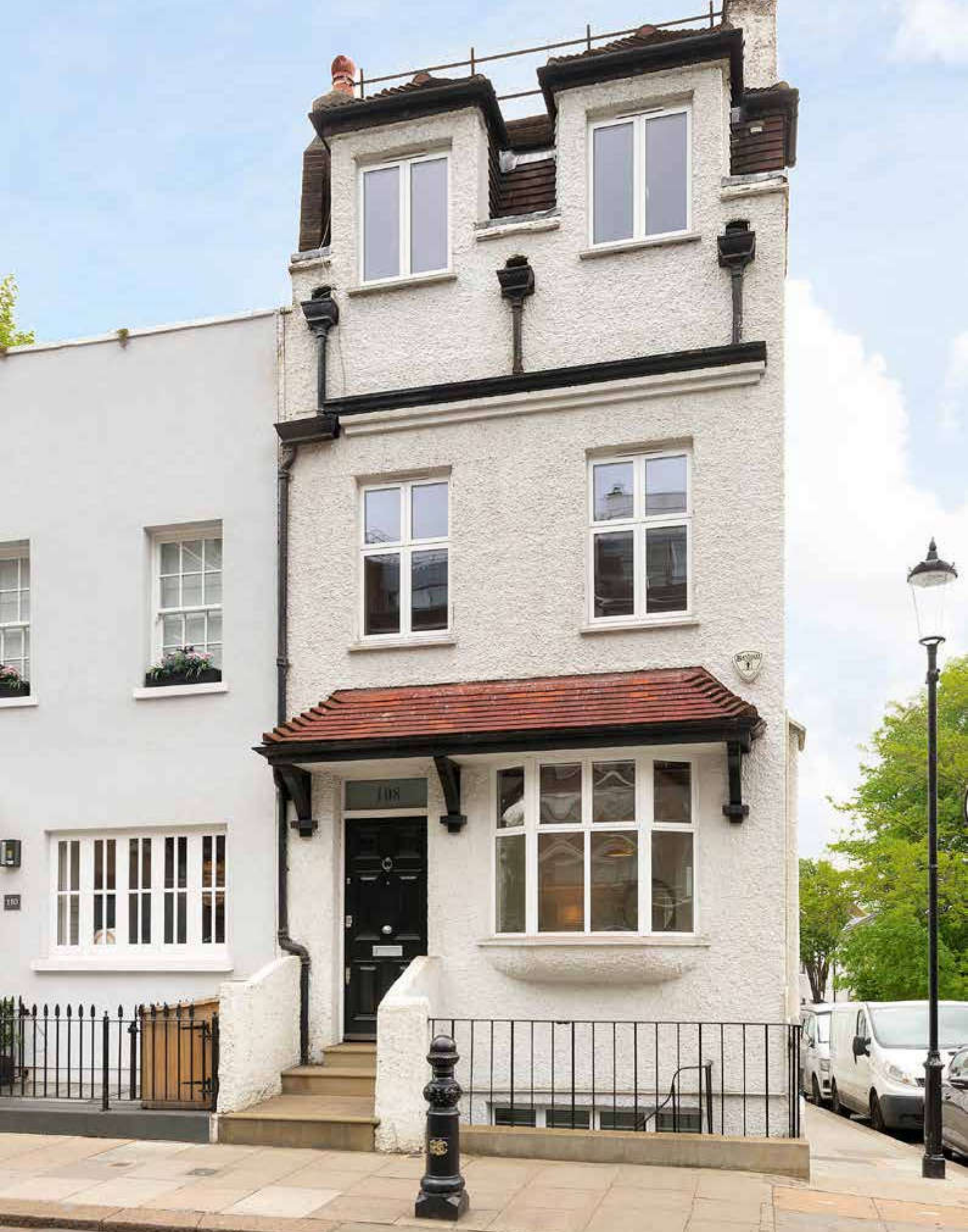
108 Campden Hill Road, Kensington, W8